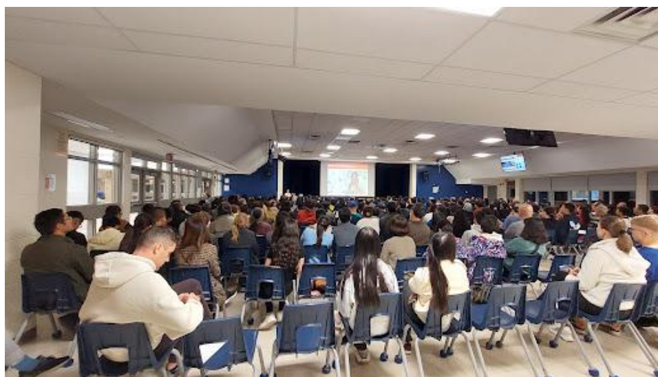
(IB info night 2024)

The IB information night took place on October 10th and it was a success. Families and students were able to walk around the building and converse with students and teachers about our program. They have also received important information about the application process for this year.